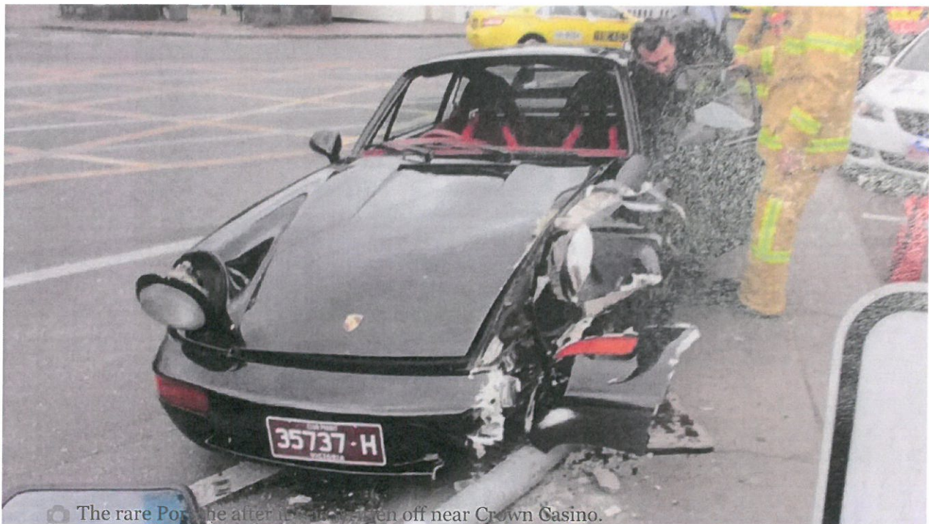
The rare Porsche after it was written off near Crown Casino.