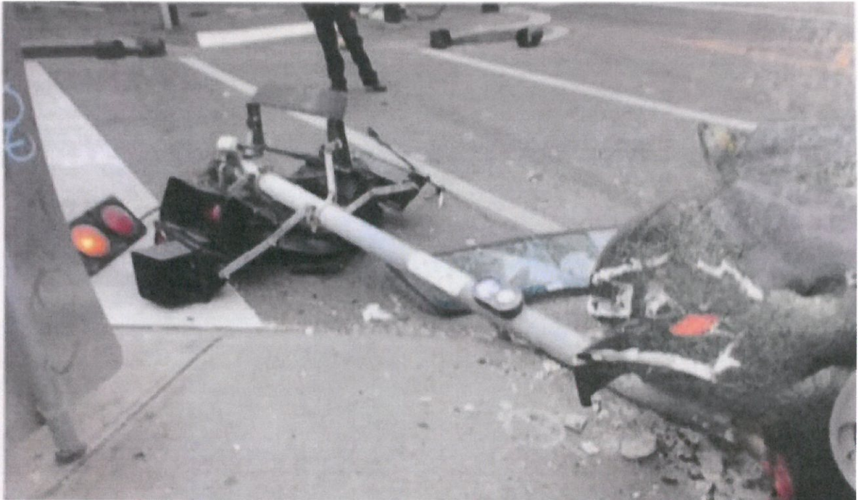
The damage to a set of traffic lights near Queensbridge St.

He had used an inheritance left to him by his father to buy the car, worth more than $100,000.